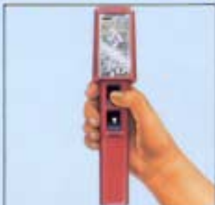
Using thumb only.