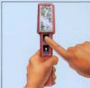
Using both hands.