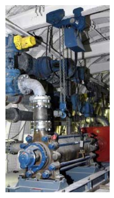
Low Headroom Pump Station