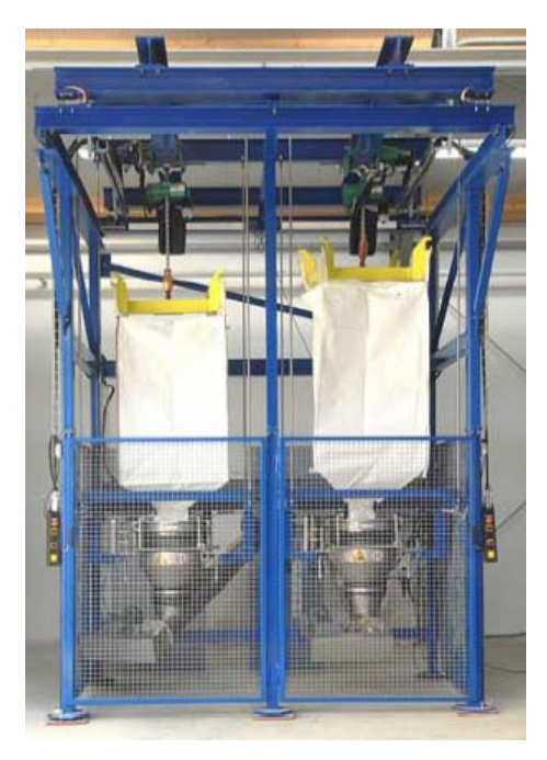
Twin BBH Systems Super-Sack Handling