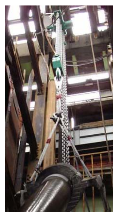
High Capacity 37.5 Ton Pipe Section Handling