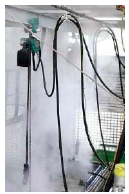
Profi Series in Tank Cleaning Facility