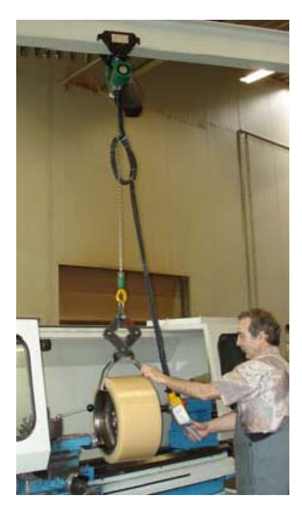
Mini Hoist Loading a Truck Wheel into a Lathe